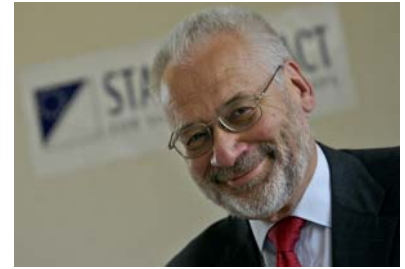
Erhard Busek, Special Co-ordinator of the Stability Pact for South Eastern Europe