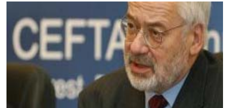
Erhard Busek, Special Co-ordinator of the Stability Pact for South Eastern Europe

Further information on CEFTA 2006 can be found on the Stability Pact's website at http://www.stabilitypact.org/wt2/TradeCEFTA.asp