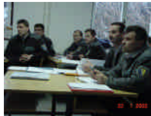
SBS officers at a training session at the Centre in Suhodol

ducting regular briefing sessions on basic refugee protection principles for officers undergoing the SBS transitional training programme. In addition, UNHCR conducted a series of six additional extensive seminars for decision-