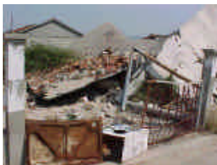
A typically destroyed house in Stolac

Until recently, houses that had been completely destroyed were excluded from reconstruction programmes due to the high cost of clearing rubble. The removal of debris poses a major hindrance to the Property Law Implementation Plan (PLIP) since DPs whose property has been devastated are forced to occupy other people's dwellings.