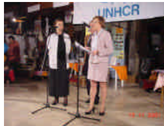
UNHCR announces the Bosnia and Herzegovina

The BWI Fair also heralded a new phase of the programme and will henceforth be known as the Bosnia and Herzegovina