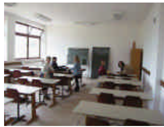
Pupils at Kamenica School

All four schools have one Bosniac teacher working alongside one Bosnian Serb teacher, except in Sjenokos where a Bosniac returnee is the only instructor at the present time. Teachers follow the Republika Srpska's cur-