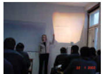
UNHCR briefing SBS Officers on protection principles

UNHCR is pleased with the co-operation that has been established with the SBS and believes that the authorities can make a significant contribution to an effective asylum system in BiH. ♦