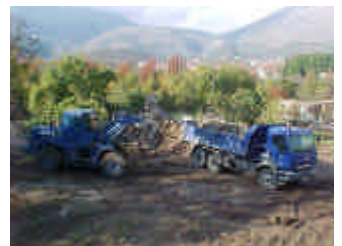
The Civil Protection Unit team in action

next reconstruction cycle due to commence in spring 2002. ◊