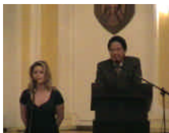
Head of UNHCR Banja Luka addresses the guests

The proceeds from the event will be used by to the Centre for Social Work to renovate the building and to purchase computers in February 2002. The Centre was founded in 1975 and was chosen by UNHCR Banja Luka on the grounds of its protection work with unaccompanied minors. ◇